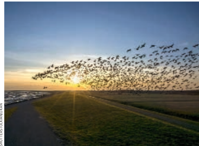
Migrating birds may use quantum effects as a kind of compass